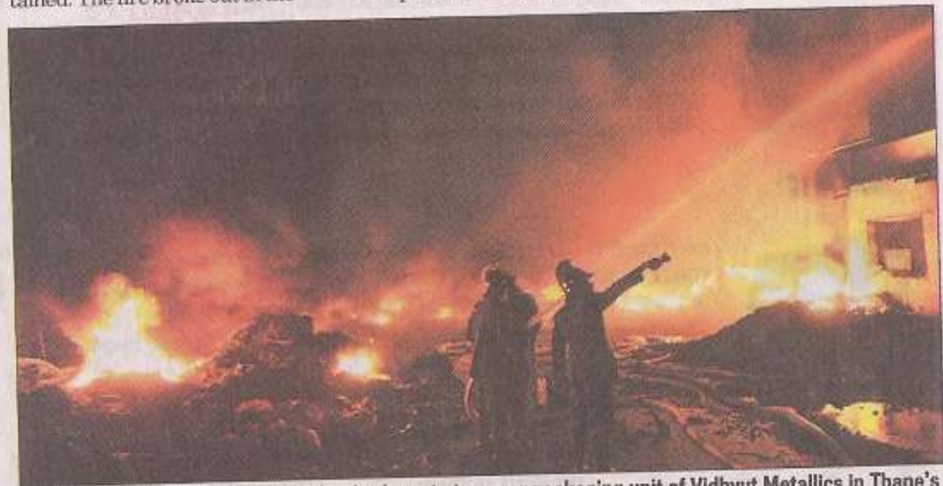
Firemen try to douse the blaze that broke out at a razor packaging unit of Vidhyut Metallics in Thane's Wagle Estate on Monday morning.

The firm employs nearly 850 workers, mostly women, at the packaging unit. Some workers and fire officials raised doubts on why it took so long to douse the blaze.